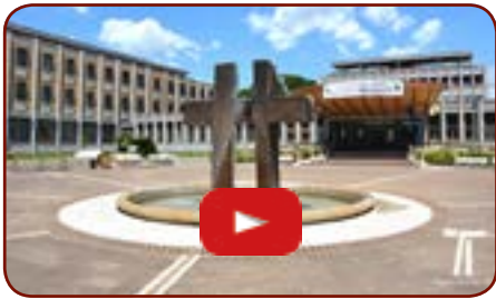
8-9 VII 2018 Roma