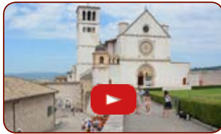
10 VII 2018 Assisi